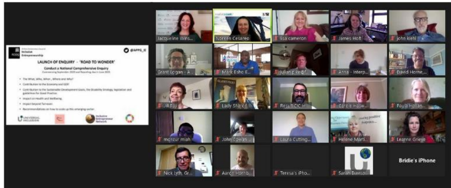
Pix B: APPG Inclusive Entrepreneurship Programme of Works